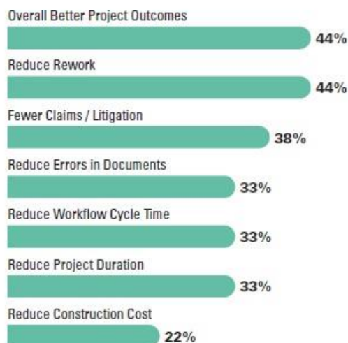
The Business Value of BIM for Infrastructure 2012 Smart Market Report.

Having this technology process is helping to enable a rethinking of the behavioral process towards more integrated project approaches like IPD and PPP in order to provide more predictable, accurate and responsible outcomes. The combination of BIM with IPD & PPPs is a great improvement on the process by itself; however neither can achieve full success in collaboration without the synergy provided in combination with the other.