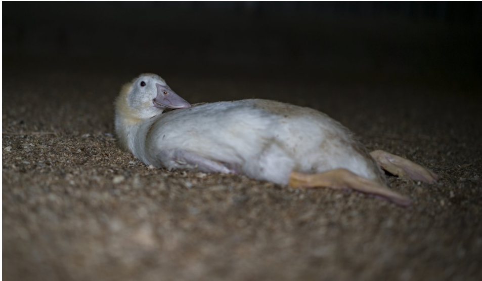
Duck in grower shed, Victoria, Australia.

To further consider an example of cruel practices, the duck shown here is from an Australian duck farm. As frequently occurs, he is on his back in a shed, unable to move.