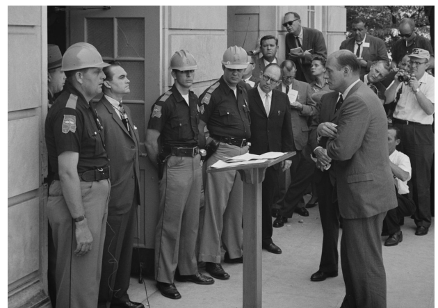
Governor George Wallace attempting to block integration at the University of Alabama, June 1963

As an example of what King and those who fought with him were contending with, in June 1963, Governor George Wallace stood at the entrance to the University of Alabama's Foster Auditorium, refusing to allow its first two African American students to register. He is seen here, supported by state troopers, defying federal deputy attorney general, Nicholas Katzenbach. He eventually departed with members of the national guard, following which the students, Vivian Malone and James A. Hood, succeeded in registering. 24