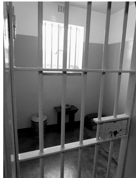
Nelson Mandela's cell at Robben Island, the prison where he spent 18 years of his 27-year incarceration.

On his return later that year, he was arrested and sentenced to five years in prison for inciting workers to strike and leaving the country without a passport. A subsequent trial for sabotage resulted in a sentence of life in prison.