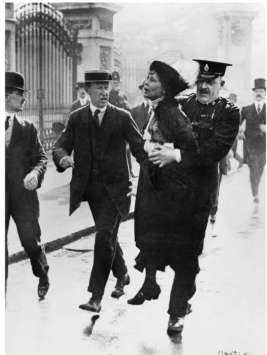
Emmeline Pankhurst arrested outside Buckingham Palace 1914

The London statue was unveiled in 1930 by Prime Minister Stanley Baldwin, who had opposed her cause. Musicians from the Metropolitan Police, some of whom had arrested suffragettes during demonstrations, asked to play for the ceremony.