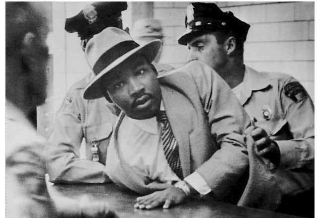
Dr Martin Luther King, Jr. being arrested in Montgomery, Alabama, for "loitering" in 1958

Through vigils, protests and demonstrations over several years, King was arrested and jailed many times.