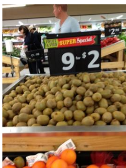
No signage no label