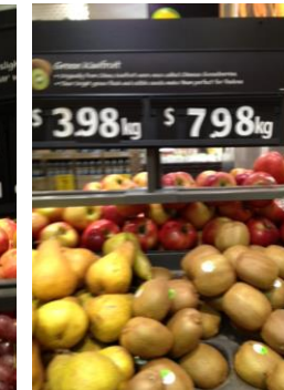
No label on fruit unreadable label