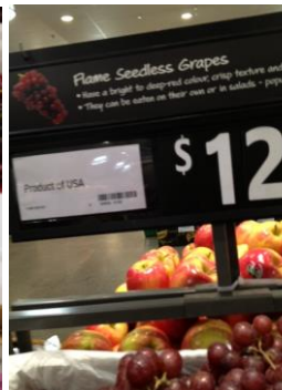
Sign added after complaint