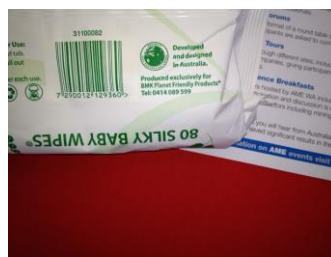
Israel bar code