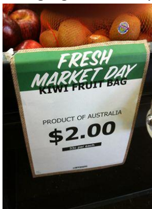
Signage on display