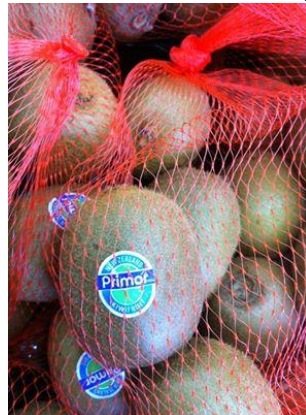
Does not match that on the fruit