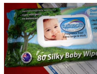
Australian flag and owned here