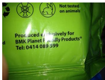
Only contact details