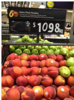
Not all fruit labelled