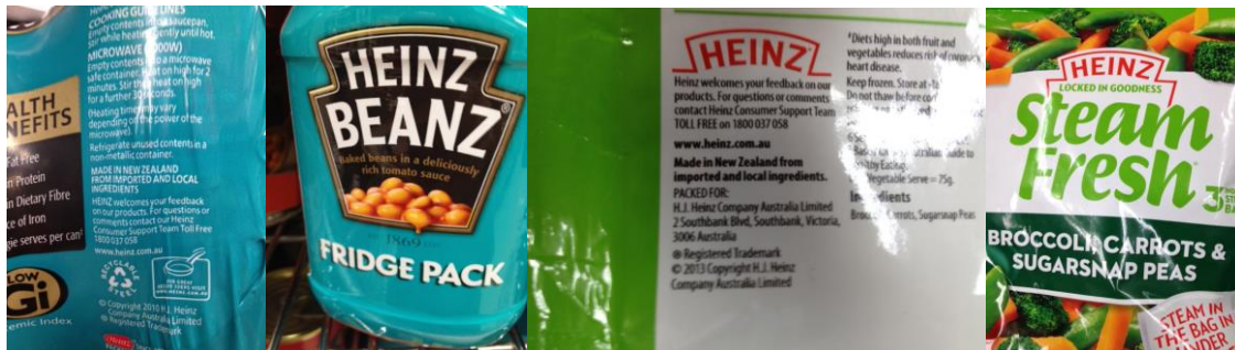
Imported and local 1869 USA