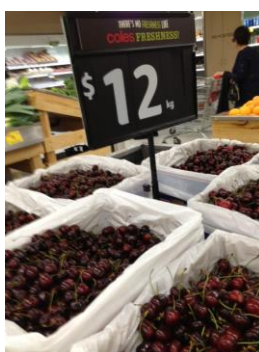
Cherries on display no signage