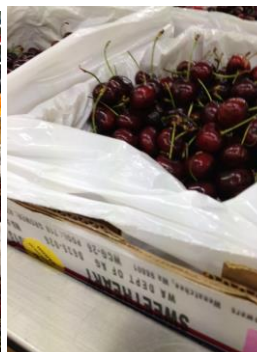
USA box uncovered by consumer