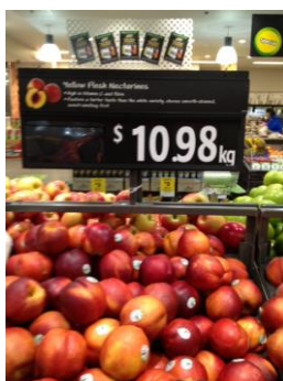
Label of fruit small