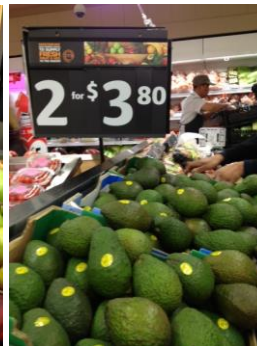
Imports in season