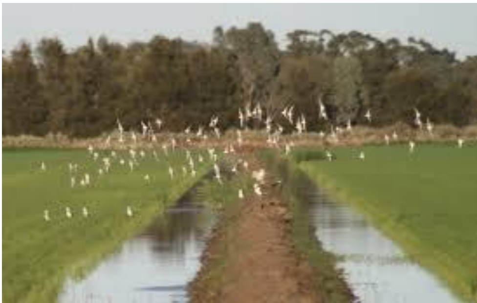
Productive farmland providing pristine habitat for aquatic species.

What has happened is the removal of water from thousands of hectares of productive farmland that was also pristine habitat for aquatic species. Much of this habitat is in farmers cropping fields and run-off wetlands established by farmers over several generations.