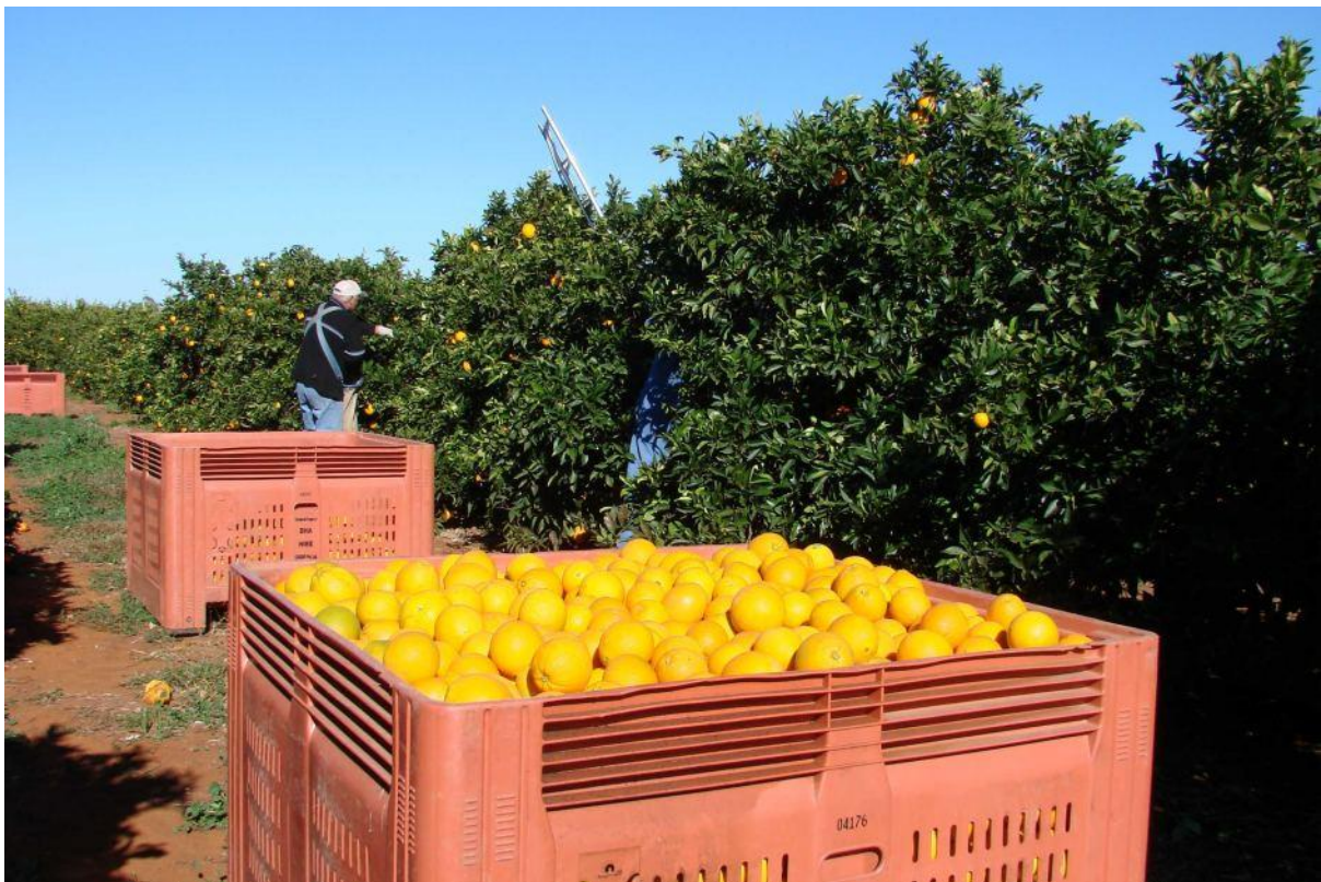
As the MDB Plan Destroys Productive Fields like this.

Productive land is being rendered unproductive and as a result uninhabitable to aquatic species as water is removed only to be flushed to the sea, in the mistaken belief that this is beneficial to “The Environment;” demonstrating that those responsible have little understanding of what “The Environment” is.