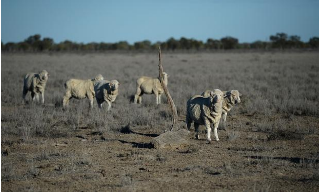
Being returned to dry land by the counterproductive MDB Plan.

Productive land is being rendered unproductive and as a result uninhabitable to aquatic species as water is removed only to be flushed to the sea, in the mistaken belief that this is beneficial to “The Environment;” demonstrating that those responsible have little understanding of what “The Environment” is.