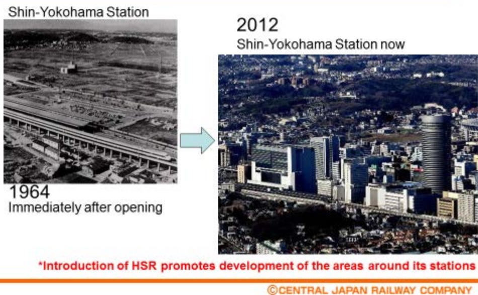
Figure 1 – Promoting development of stations