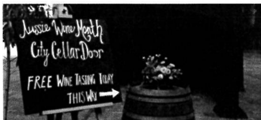
City Cellar Door to pop-up in Sydney for Aussie Wine Month