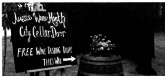
City Cellar Door to pop-up in Sydney for Aussie Wine Month