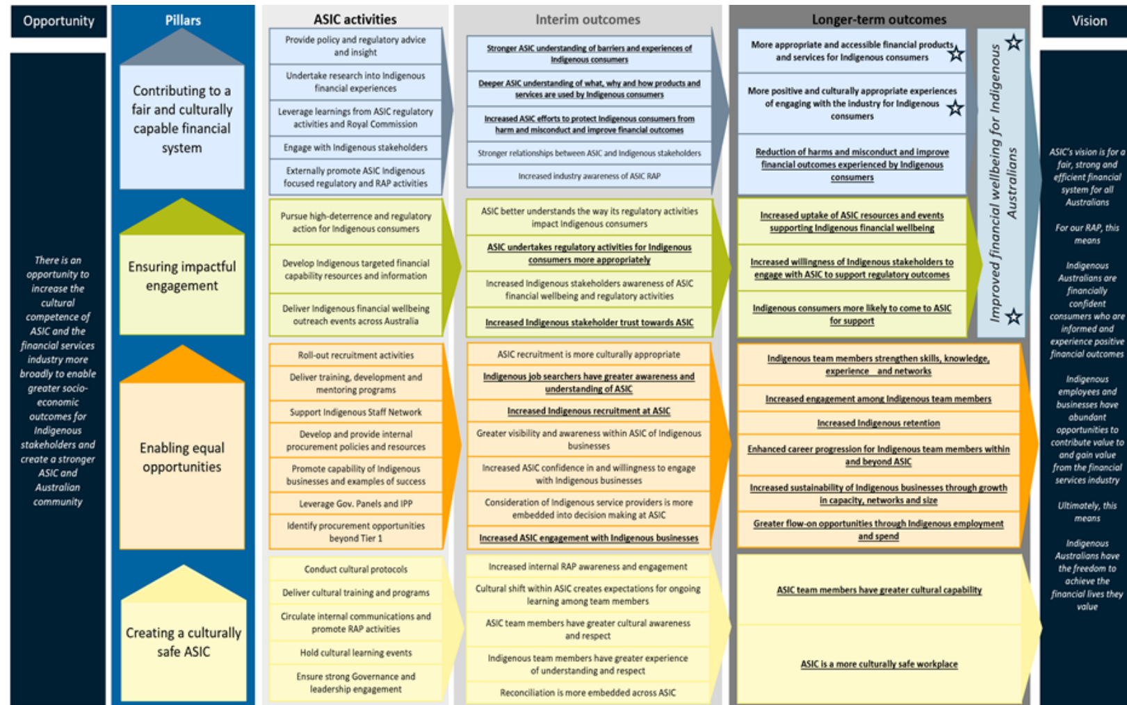
Figure 2: Reconciliation Action Plan theory of change

Note: For a description of ASIC's outcomes measurement approach, see paragraphs 38–39 of this submission (accessible version).