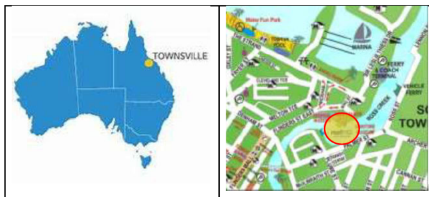
Figure 1. Location map of Reef HQ in Townsville, Australia.