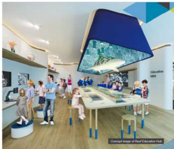
Figure 2. Concept image of Reef Education Hub