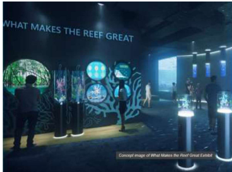
Figure 5. Concept image of 'What makes the Reef Great' exhibit.