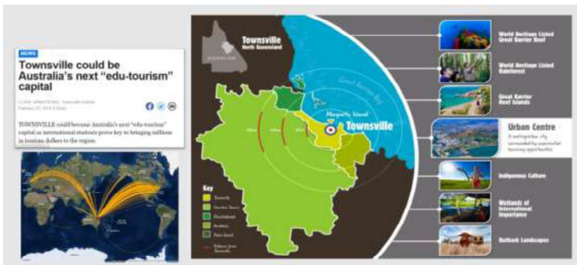
Figure 4. Townsville's EduTourism potential