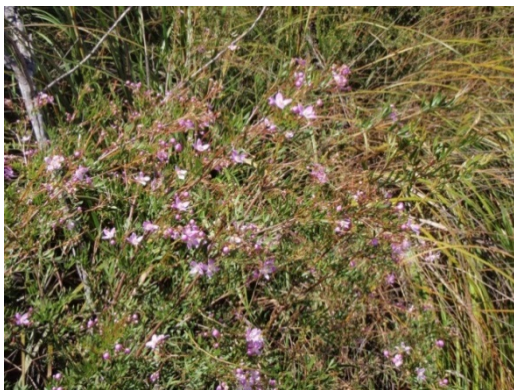
Plate 5 – Flowers of Boronia rivularis observed during the recent site inspection.

Boronia rivularis continues to thrive within the translocated heathland at the USC site. Its autecology has also been catered for and its long term survival will be ensured with the implementation of the fire management plan. It was observed across the site during the recent site inspection in full bloom (Plate 5) and present as numerous seedlings.