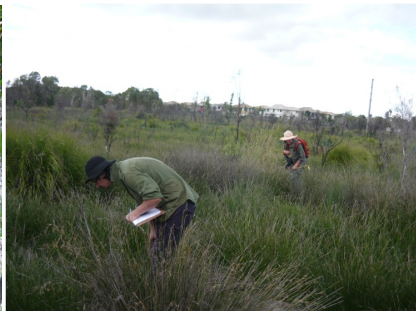
Figure 3 Post-fire survey