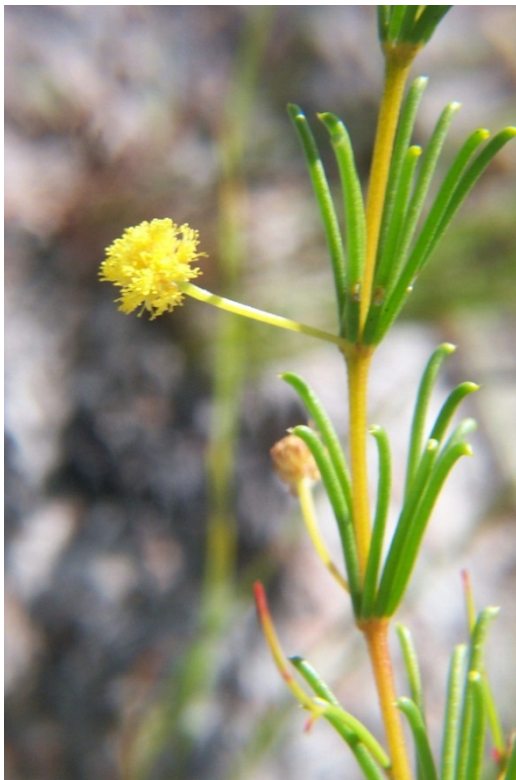
Plate 3 – Flowers of Acacia baueri ssp. baueri with the characteristic whorled phyllodes.

The common name of Tiny Wattle accurately portrays the diminutive size of Acacia baueri ssp. baueri as depicted in Plate 3 below. The whorls of phyllodes are diagnostic for this small Acacia sp., but it does share some ecophysiological similarities with Acacia attenuata .