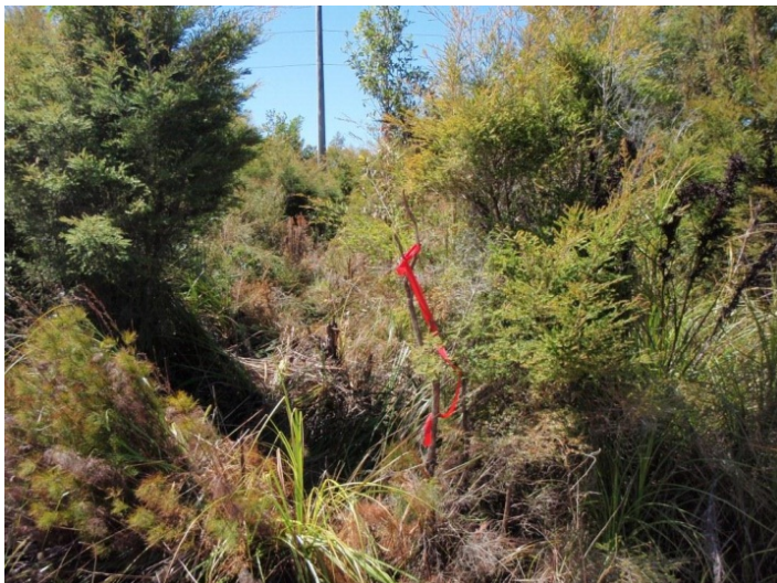
Plate 7 – Trail of slashed vegetation created by surveyors placing pegs associated with the Energex power line easement. Both Acacia attenuata and Boronia rivularis were damaged by these recent destructive works.

It is unfortunate that Area 7 is not scheduled for burning this year as recent survey damage by Energex to the EVR species in that area could have, in part, been compensated for by the germination of seed of the same species and coppice of the damaged individuals in that area. Given the protection afforded the EVR species under legislation such as the Queensland Nature Conservation Act 1992 and the Commonwealth Environment Protection and Biodiversity Conservation Act 1998, it is unclear why Energex did not follow best practice survey methods and use a DGPS and walk through the species rich heathlands as opposed to slashing a track to place their survey pegs (Plate 7 below). It is hoped this is the last instance of this environmentally harmful work associated with the Energex managed power line easement on the site.