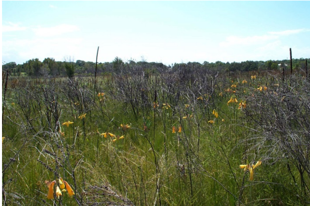
Plate 4 – Flowers of Blandfordia grandiflora in the Girraween Estate 2 years after fire. Such displays of Blandfordia grandiflora in the Girraween Estate have not been observed in recent years, nor has the recent presence of Pezopourus wallicus (Ground Parrot) been confirmed from that area.

The lack of fire in the Girraween Estate (Plate 4 below) has meant a dearth of Blandfordia grandiflora flowers and the possible loss of Pezopourus wallicus (Ground Parrot) from that area. Fire is required in that area to ensure the maintenance of the heathland biodiversity that is assured within the translocated heathland at the USC site given the implementation of the fire management plan.