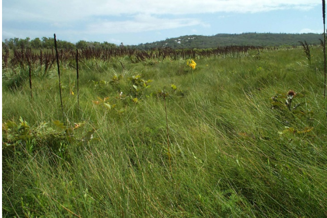
Plate 6 – Colony of Schoenus scabripes with an emergent flower of Blandfordia grandiflora in the Girraween Estate.

As with Blandfordia grandiflora , Schoenus scabripes is diminishing in the Girraween Estate due to the lack of a recent fire (Plate 6). The implementation of the fire management plan will ensure the long term survival and viability of this species in the translocated heathland at the USC site.