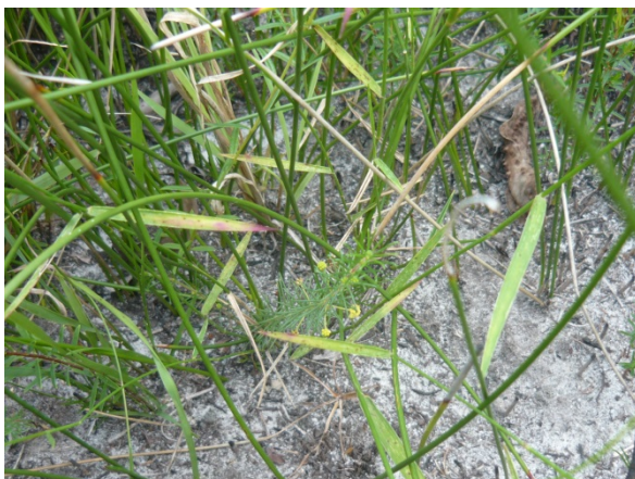
Figure 2 Acacia Baueri with flowers

Areas 7, 7a and 8 were burnt according to schedule in August 2013. Initial reports states that the fire seems to have stimulated plants to either re-sprout from root stocks on site and/or for soil stored seed to germinate. The plants have grown well in this time and the majority seem to be in flower.