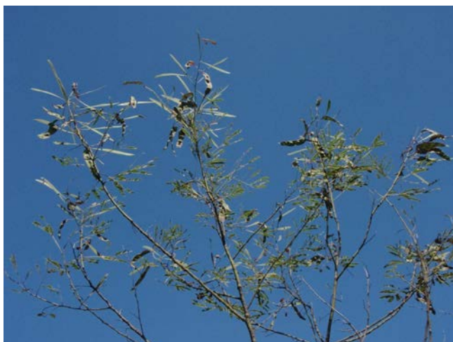
Plate 2 – Seed pods on mature Acacia attenuata within the translocated heathland at the University of the Sunshine Coast.

There were a number of moribund (or nearly moribund) individuals of Acacia attenuata observed across the site during the recent site inspection (See Frontispiece). Equally, there were many recently germinated and/or established seedlings and saplings observed across the site. The older (mature) individuals continue to supply seed to the soil seed bank (Plate 2).