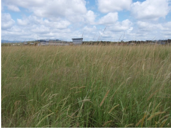
Plate 1 – Setaria sphacelata dominated former sugar cane cultivation lands prior to the translocation of heathland from Bundilla to the University of the Sunshine Coast.