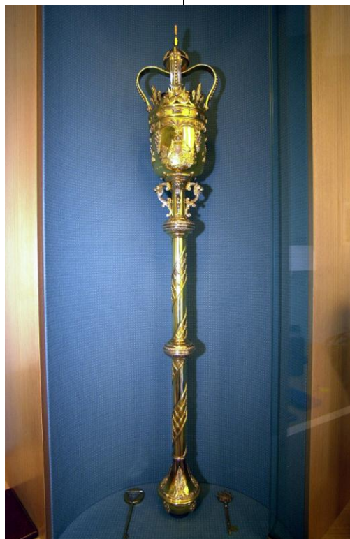
The Mace is the symbol of the House's authority

The committee itself cannot impose penalties. Its role is to investigate and advise. In its report to the House the committee usually makes a finding as to