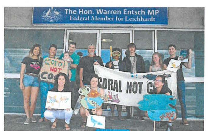
PROTEST ACTION: Outside Warren Entsch's office.