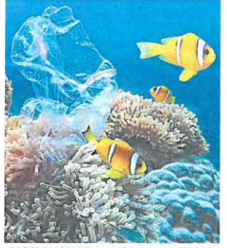
NOT WANTED: Plastic pollution around a coral reef with sea anemones and clownfish.