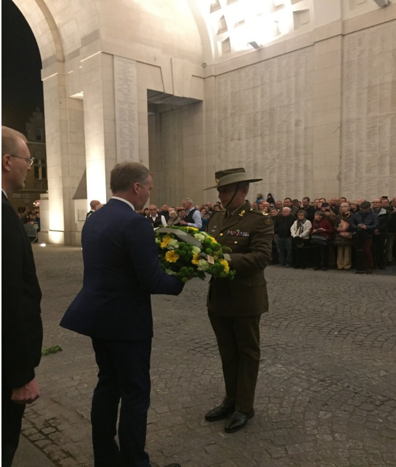
The Hon. Tony Smith MP laying a wreath at the Menin Gate