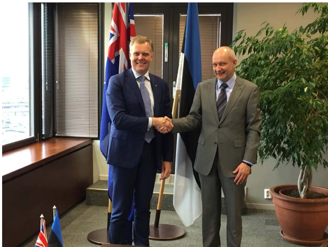
The Hon. Tony Smith MP and Deputy Minister Matti Maasikas