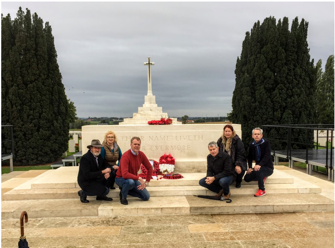
The delegation at the Tyne Cot cemetery