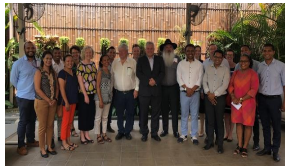
The delegation with Australia Awards alumni

Australia Awards alumni include several ministers in the current government of Timor-Leste, as well as other senior and influential leaders in Parliament, civil service, business and academia. Importantly, these include a strong representation of women. The delegation was able to discuss issues relevant to both countries at a morning tea held with a group of the alumni, finding them articulate and thoughtful interlocutors, committed to the future of their country and to its friendly relations with Australia. The alumni universally expressed support for the program and the opportunity it had provided to them.