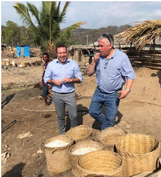
Ambassador Roberts and Senator Rex Patrick taste locally-produced salt at Surilaran, Atabae

Members of the cooperative also raised with the delegation their need for a secure shed to store the salt while awaiting collection, to better protect it from the elements and enable them to increase production.