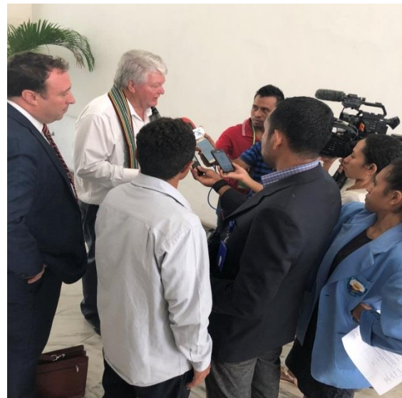
Delegation leader Mr Ken O’Dowd MP speaks to local media during the visit

Negotiations over maritime boundaries in the Timor Sea, and the related development of oil and gas resources there, have long been a source of difficulty dominating the bilateral relationship. However, in March 2018 Australia and Timor-Leste signed a new treaty, agreeing for the first time on a permanent maritime boundary. 1 The treaty is seen by both countries as a turning point in our relations.