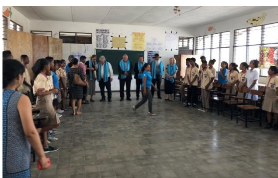
The delegation observing a reproductive health class in progress at Liquica Secondary School

More generally, Mr Nunes observed that this was the only public high school in Liquica, and had grown rapidly since it was established in 1993, from less than 100 students to almost 1900 across two campuses today. Individual classes sometimes had up to 100 students, and the principal emphasised the need for more classrooms so that class sizes could be reduced.