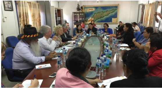
The delegation meeting with the Parliamentary Women's Group (GMPTL)

and promoting an inclusive legislative agenda on issues affecting women, children and other vulnerable people.