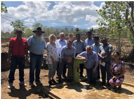
Community members and project staff with the delegation at Suku Odomau, with one of the taps installed under the PNDS clean water project

Under the program, communities are granted a set amount of funds per year to use for a small-scale infrastructure project of their choosing. Community ownership and leadership is central to the program. Australia supports the program by funding assistance in the form of planning, financial, social and technical expertise to advise and support the communities undertaking the projects.