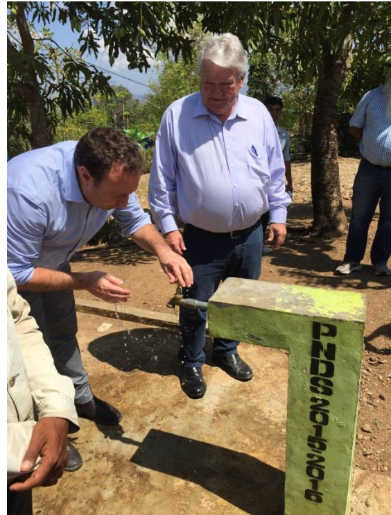
Ambassador Roberts and delegation leader Ken O'Dowd MP test the water at Suku Odomau

In 2016 the community at Suku Odomau decided to prioritise access to clean water in five villages where people had previously needed to walk a long way to obtain fresh water from a river or spring. For a total cost of US $13,000, a water tank, almost 3km of gravity-fed pipeline and five taps were installed, providing clean water to approximately 90 households.