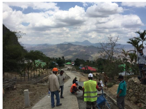
Rehabilitation of the Maliana-Saburai road

Finally, the delegation visited a salt farm at Surilaran, Atabae, operating with support from the Market Development Facility (MDF), a multi-country private sector development program. MDF supports private sector businesses to provide market opportunities which will in turn facilitate employment and enterprise in local communities.