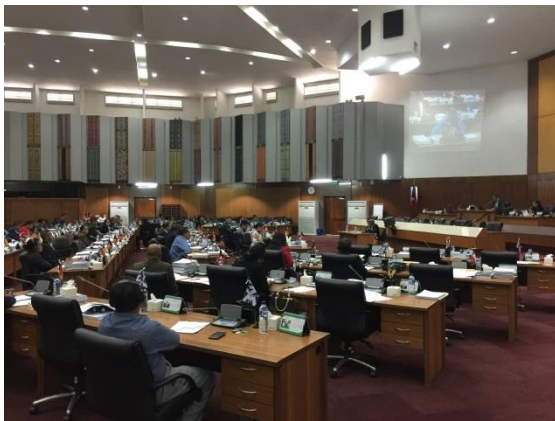
Timor-Leste's National Parliament in Plenary Session, 29 October 2018

The delegation visited the Parliament of Timor-Leste, and observed a 'Plenary Session'. The Parliament meets in Plenary Session every Monday and Tuesday to consider motions and bills. During the delegation's visit the major item before Parliament was the 2019 national Budget.