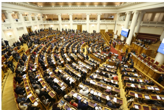
The 137 th Inter-Parliamentary Union Assembly

The IPU Assembly is the principal statutory body of the IPU. It meets bi-annually to bring together parliamentarians to study international problems and make recommendations for action. The assemblies include debates on significant international issues, the regular meeting of the IPU Governing Council, and meetings of specialist committees, working groups and geopolitical groups.