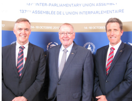
Senator Chris Ketter, Senator the Hon Ian Macdonald and Mr Josh Wilson MP

The Australian Parliament's delegation to the Assembly was led by Senator the Hon Ian Macdonald, and included Senator Chris Ketter and Mr Josh Wilson MP.