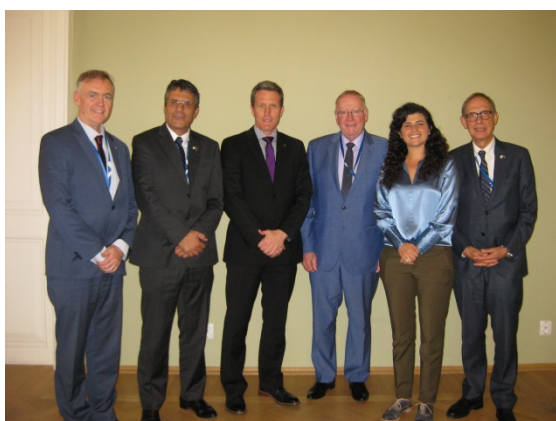
Senator Chris Ketter, Mr Josh Wilson MP and Senator the Hon Ian Macdonald with delegates from the Knesset in Israel

The IPU Assembly offers the Australian delegation the unique opportunity to meet informally with other parliamentarians to discuss and share information about issues of mutual interest, and build on parliament-to-parliament relationships. Bilateral and multilateral meetings complement this opportunity. During the 137 th Assembly in St Petersburg, bilateral meetings were held with delegations from the Republic of Belarus, Singapore, Israel and the Islamic Republic of Iran. In addition, the Australian delegation met informally with delegates from Pacific nations.