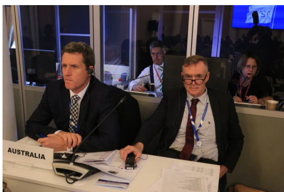
Mr Josh Wilson MP and Senator Chris Ketter during a meeting of the Twelve Plus Group

The Twelve Plus Group met four times during the Assembly. The group considered reports from the standing committees, discussed positions on debating topics and considered nominations for vacancies to be filled during the Assembly. Mr Wilson acted as a teller for one of the election processes, and Senator Ketter as a scrutineer.