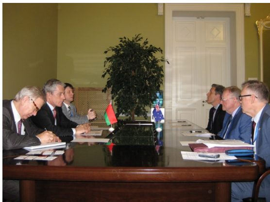
Senator Chris Ketter, Senator the Hon Ian Macdonald and Mr Josh Wilson MP meeting with delegates from the Republic of Belarus

The IPU Assembly offers the Australian delegation the unique opportunity to meet informally with other parliamentarians to discuss and share information about issues of mutual interest, and build on parliament-to-parliament relationships. Bilateral and multilateral meetings complement this opportunity. During the 137 th Assembly in St Petersburg, bilateral meetings were held with delegations from the Republic of Belarus, Singapore, Israel and the Islamic Republic of Iran. In addition, the Australian delegation met informally with delegates from Pacific nations.