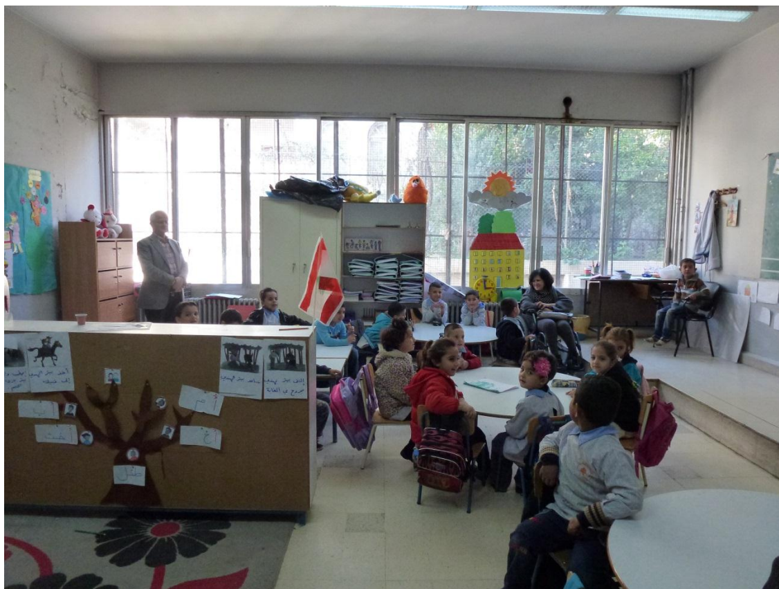
Figure 7: A class at Hosh Al Omara Intermediate Public School

School administrators told the delegation that most of the Syrian children at the school have experienced trauma or other psychological problems, and many are victims of domestic violence. The school was also concerned about lice, scabies and polio and, in addition to UN and Lebanese-government vaccination programs, had started offering medical and dental check-ups for Syrian students.