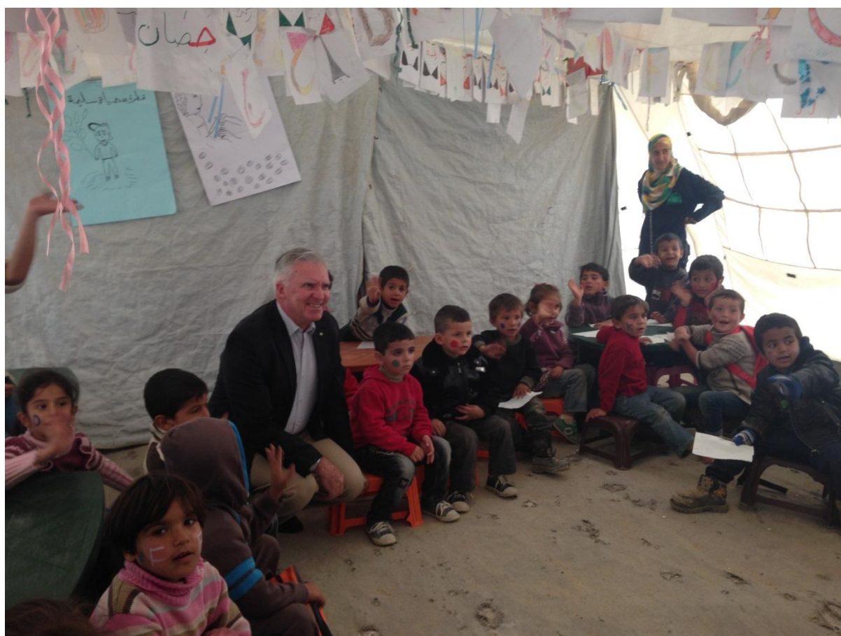
Figure 8: A class at the UNICEF centre in Zahle

Whilst in Zahle, the delegation also had the opportunity to visit a UNICEF centre located near an informal refugee settlement. At the facility, UNICEF provides school classes as well as life skills training and psychosocial support from counsellors and social workers (see Figure 8). Children at the centre were engaged and enthusiastic in their academic classes as well as music and drama workshops where they were learning about the importance of things such as hand-washing and vaccination.