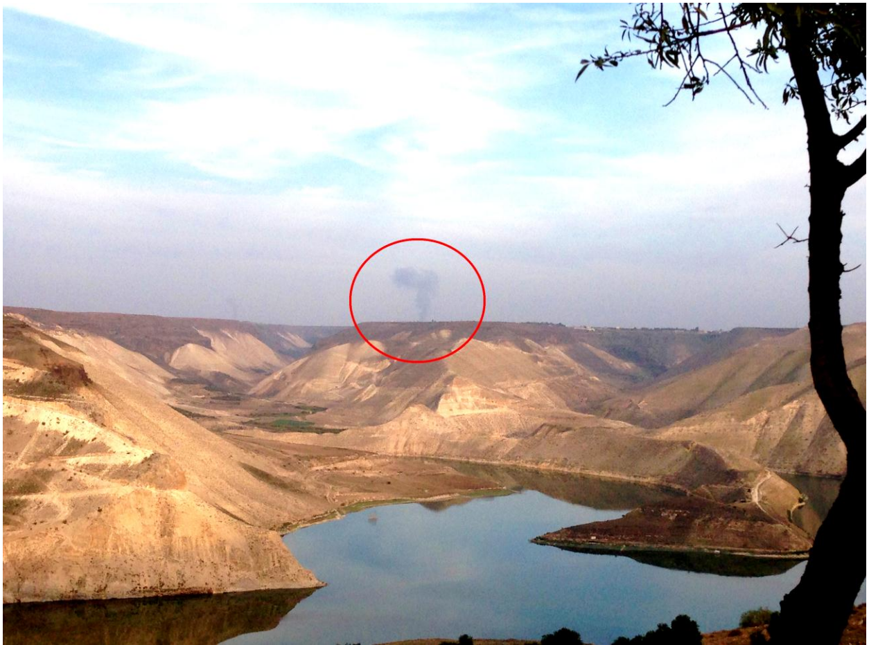
Figure 3: The Jordan-Syria border with a plume of smoke from artillery fire

impression that this was the case, in large part in response to the pressures and impact on host communities. In Jordan, the delegation met with the Jordanian Border Guard Forces on the Syrian border (see Figures 3 and 4). The number of border crossings between Syria and Jordan has been reduced from 45 to five and those border crossings still open are located in the far north east of the country meaning Syrian refugees have to travel large distances to reach them. The Jordanian Border Guard Forces—which have provided much assistance to Syrian refugees crossing the border—cited security concerns and the risk of Islamist extremists posing as refugees entering the country as the reasons for the crossing closures.