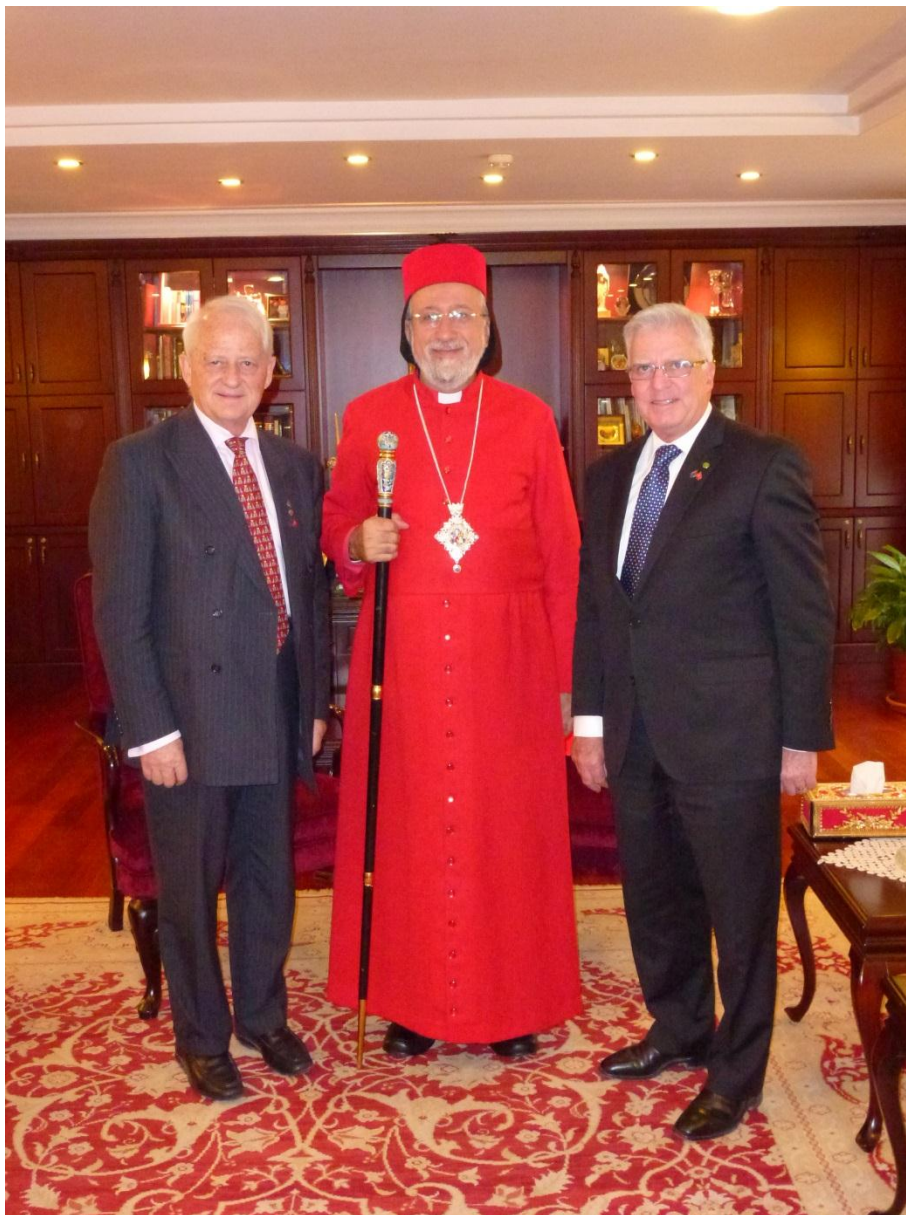
Figure 11: Delegates with Archbishop Yusuf Cetin

Archbishop Cetin told the delegation that Syriac Christians lived in Syria, Lebanon, Iraq, Turkey and Palestine 21 and that the Church's patriarch split his time between Syria and Lebanon. Prior to the Syrian conflict the Syriac patriarch could travel around Syria in full robes and he was afforded respect; Archbishop Cetin told the delegation that now even in Church the patriarch was not safe. Archbishop Cetin also informed the delegation that prior to the conflict there were approximately 250 000 Syriac Christians in Syria but now it is unknown how many remain. Those who have fled, Archbishop Cetin told the delegation, do not want to return because there is no stability and no certainty about the future.