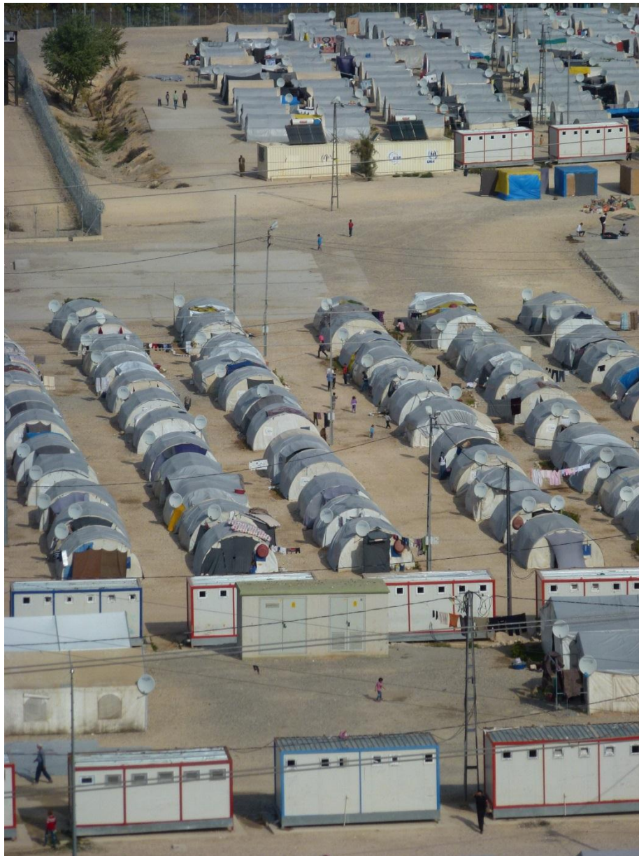
Figure 9: Nizip tent refugee camp

Lebanon is hosting the largest number of refugees per capita in the world with 1.2 million UNHCR-registered Syrian refugees and possibly up to 2 million refugees in total in the country. Syrian refugees in Lebanon reside in the community or informal settlements (see Figure 10). The scale of the needs of refugees has consistently outstripped available resources and capacity, resulting in rising tensions within Lebanese host communities. During a visit to Hosh Al Omara Intermediate Public School in Zahle the delegation heard from school administrators that initially Lebanese people felt pity for Syrians fleeing the conflict but this has turned to bitterness and resentment in response to the support being provided to refugees. Press reports have suggested that many Lebanese fear that 'the presence of more than a