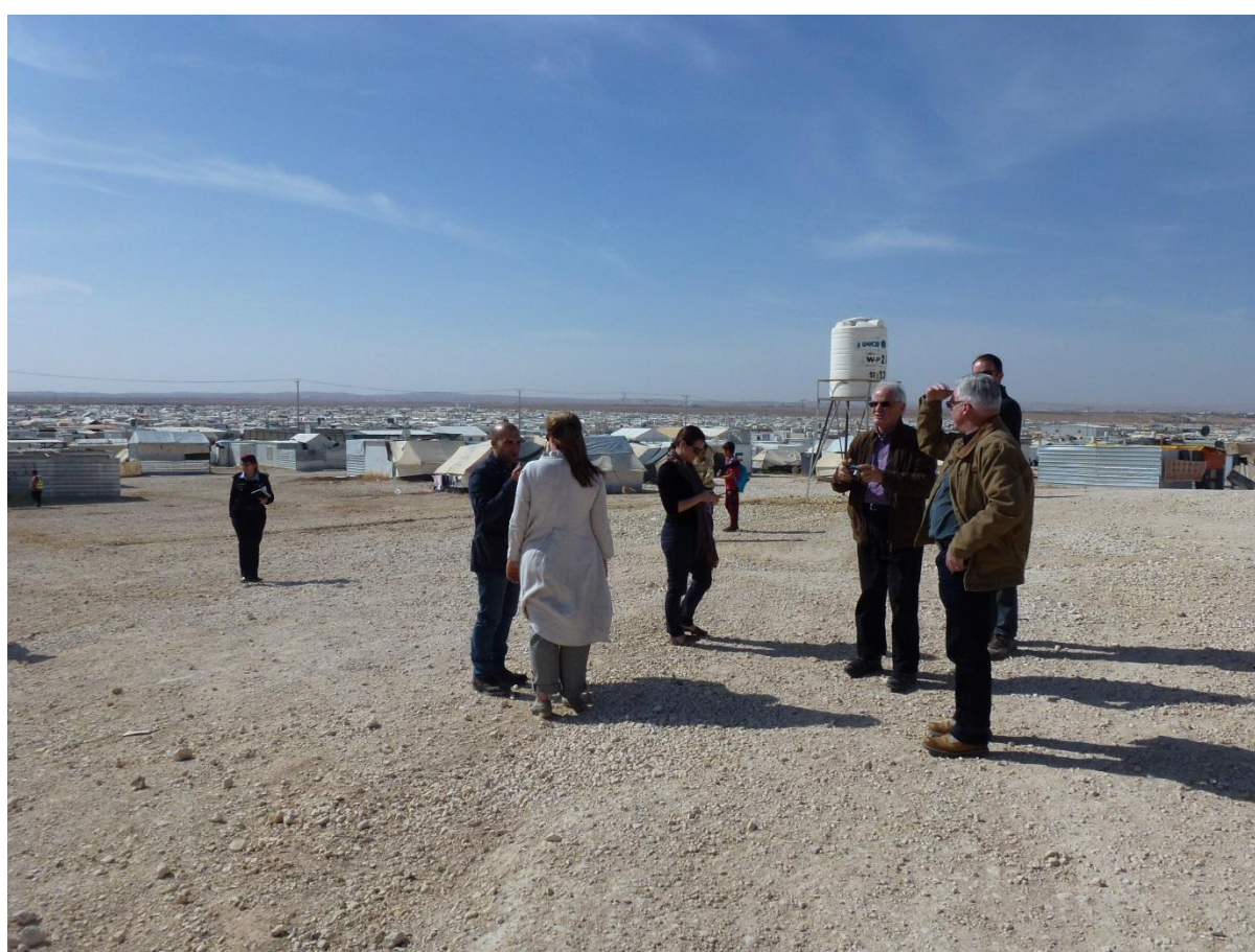
Figure 5: Za'atari refugee camp in Jordan

In the 24 government-managed refugee camps in Turkey, there are around 220 000 refugees in total including 80 000–90 000 school-aged children. AFAD, the Turkish government agency responsible for the camps, provides services including school, social and cultural classes and vocational training. AFAD told the delegation that approximately 70 000 children in Turkish refugee camps are attending the school