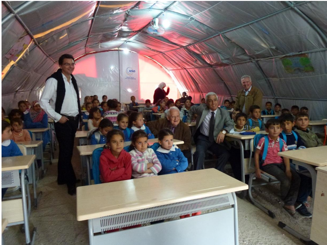
Figure 6: A class at Nizip refugee camp in Gaziantep, Turkey

Similar language difficulties are encountered in Lebanon. UN representatives informed the delegation that there are 400 000 school-aged child refugees in Lebanon. Approximately 100 000 of these children are in government schools; however, part of the school curriculum (maths and science) in Lebanon is taught in either French or English presenting a language barrier for Syrian children.