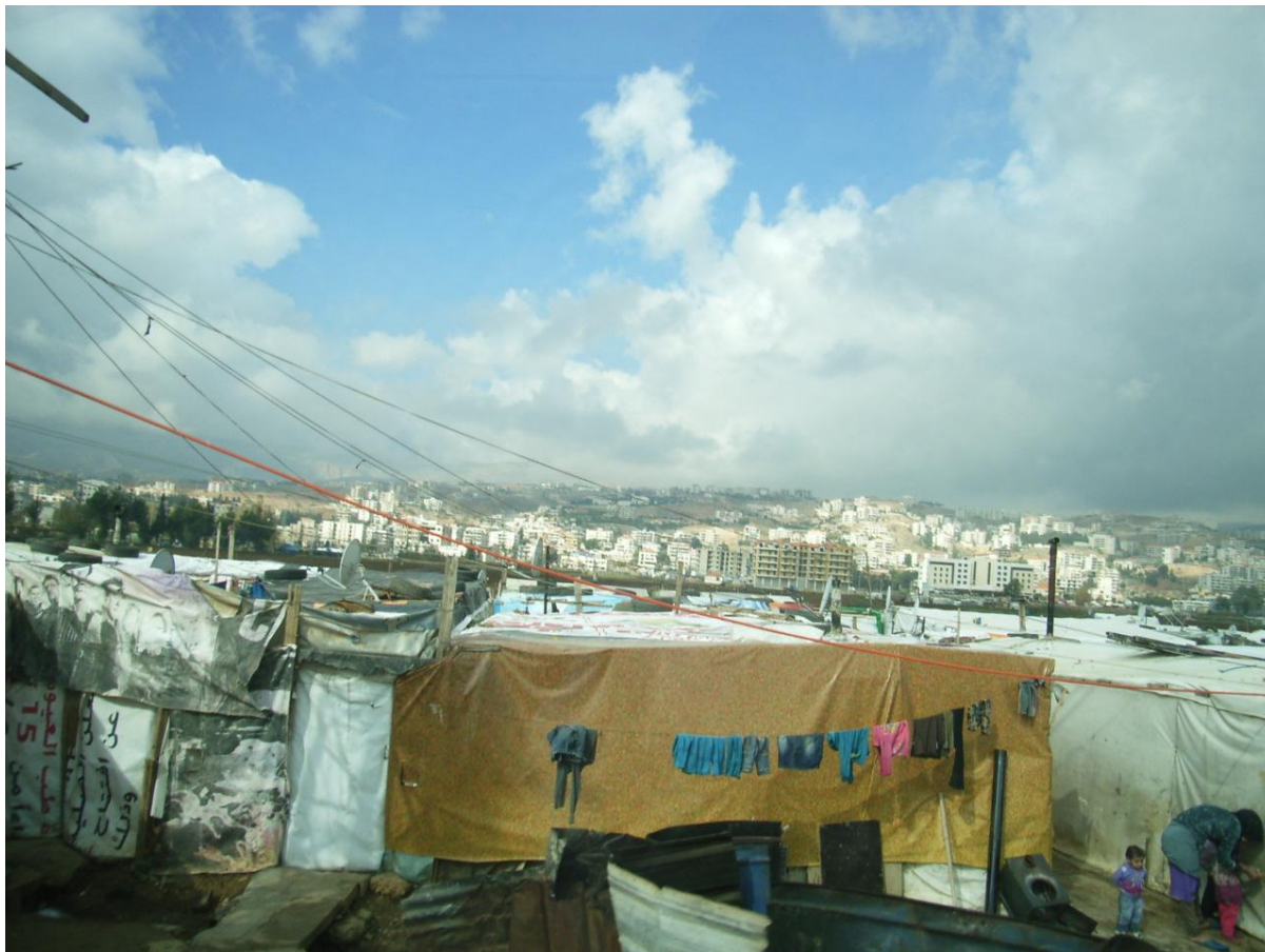
Figure 10: An informal refugee settlement on the outskirts of Zahle, Lebanon

Whilst in Lebanon the delegation met with HE Rashid Derbas, Minister for Social Affairs, who discussed the pressures on the electricity network, roads, waste water infrastructure and education system. For example, according to the UNDP, households in Lebanon have been getting on average two hours less electricity per day as a result of the pressure on infrastructure. Mr Derbas explained that much of Lebanon's infrastructure was planned to last until 2024 but the additional pressure placed on it by the influx of refugees means it may not last until 2016.