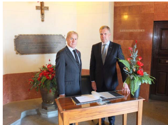
Photo: Right Honourable David Carter and the Hon Tony Smith MP at the National War Memorial.

The Australian Memorial is a striking memorial which celebrates the close relationship between the two countries, and commemorates those lost fighting.