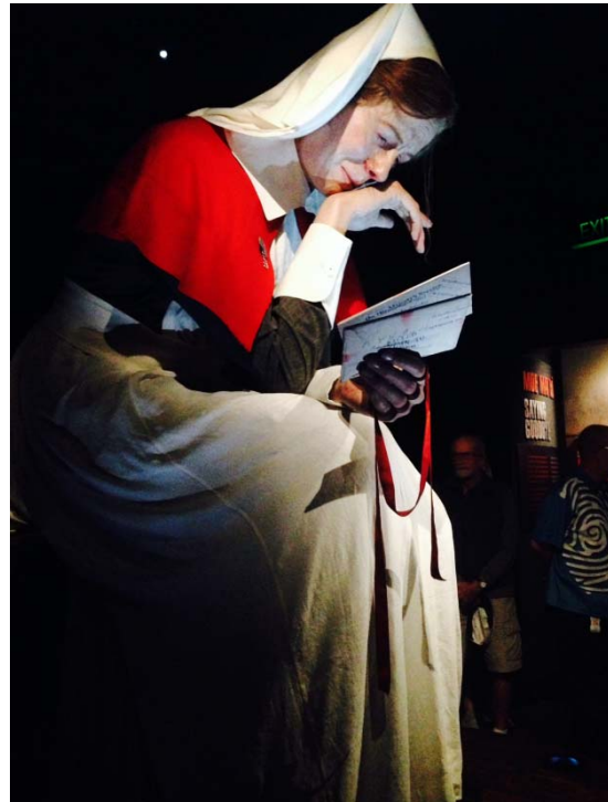
Model from Te Papa Gallipoli Exhibition

This exhibition is particularly relevant as both Australia and New Zealand commemorated the centenary of Gallipoli in 2015.