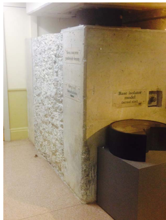
Photo: Parliament building foundations demonstrating the base isolation earthquake proofing system.

The delegation was led through the underground walkway that connects the buildings and was shown the impressive base isolation earthquake proofing system that is used in the building.