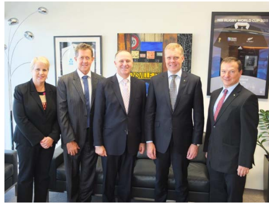
Photo: Delegation members with, the Right Honourable John Key, Prime Minister of New Zealand

The Prime Minister welcomed the delegation to his offices and was quick to reaffirm the importance of the relationship between New Zealand and Australia.