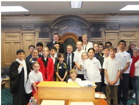
Photo: Delegation members with a school group in the Education Centre's mock debating chamber.

The delegation spoke briefly with accompanying teachers and some of the children about what they had learned, as well as posing for photos with the group.