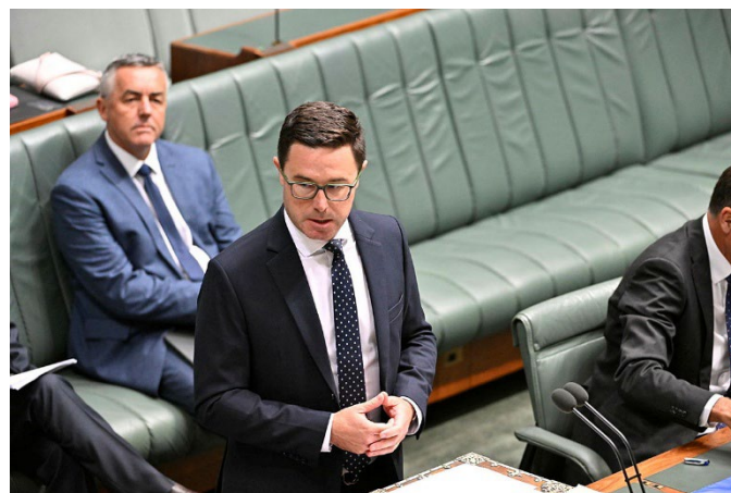
Time is reserved each sitting Monday for private members' business in the House and Federation Chamber.

Private members' business —Private members (that is, members who are not ministers or assistant ministers) may lodge notices to be moved and debated on sitting Mondays. Private members' notices (and orders of the day) may be moved and debated at the times allowed on Mondays under the standing orders, if selected by the Selection Committee for introduction (or further debate). (See also Infosheet No. 6 Opportunities for private members .)