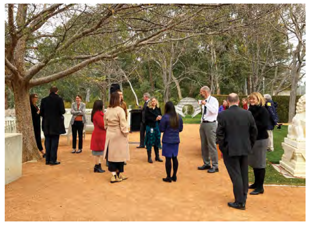
The department's Social Club comes together for its annual general meeting, 30 July 2020.

The Department of the House of Representatives Social Club was limited in its ability to bring staff together in person due to the COVID-19 pandemic. Instead, the club shifted its focus to activities that were COVID-safe, including outdoor morning teas, fortnightly book sales and raffles, small team celebrations for Christmas and coordinating charitable donations. During the financial year, the club raised over $3,900 for various charities through its participation in Jeans for Genes Day, STEPtember, Walk for Autism and the Push-Up Challenge. The club also donated non-perishable items to the Canberra Basket Brigade's Christmas appeal to help those who are in need in the local community.