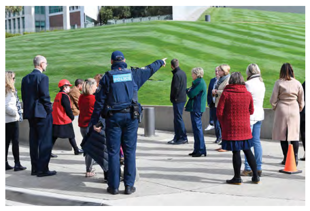
Departmental staff participating in an evacuation exercise at Parliament House.

A departmental business continuity plan was in force throughout the reporting year, complemented by office-level business resumption plans. The business continuity plan is managed by the Serjeant-at-Arms and endorsed by the Clerk. The business continuity network, with representation from across the department, is responsible for business continuity governance and oversight.