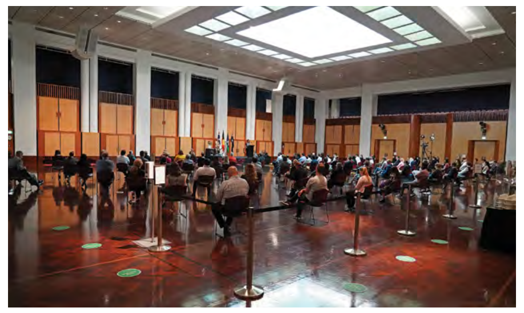
A physically distanced departmental conversations meeting in the Great Hall at Parliament House, 3 November 2020.

The Deputy Clerk, Serjeant-at-Arms and Clerks Assistant met formally with executive level staff several times during the period and led conversations about corporate and strategic issues. The outcomes of these conversations were included at two formal strategic planning meetings of the Executive. The strategic priorities derived were then shared with the department at the annual departmental conversations meeting, and with the Audit and Risk Committee at the annual briefing from the Clerk.