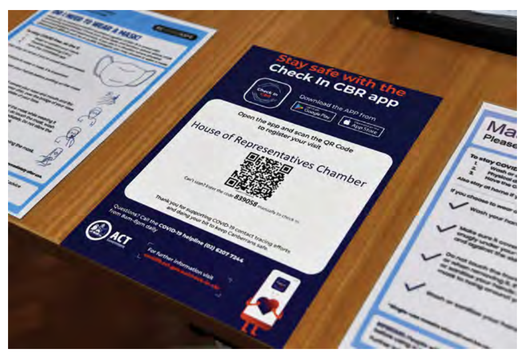
One of the COVID-19 information and check-in stations located throughout Parliament House, providing masks, hand sanitiser and the Check In CBR QR code, May 2021.

The Serjeant-at-Arms' Office continued to work closely with the other parliamentary departments and health authorities to continually review COVID-19 arrangements and ensure that necessary measures were in place for the safety of all staff working at Parliament House.