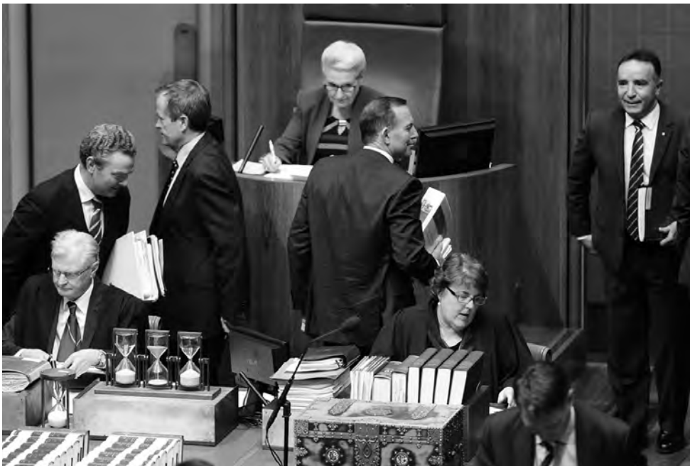
The Speaker presiding over a division in the House of Representatives.

Queries of the bills and legislation collection on the website totalled 23.6 million during the year, an increase of 8.8 per cent from the previous year (21.7 million in 2013–14). This total represented 22.0 per cent of the queries made through ParlInfo Search. Work to include bills from earlier parliaments back to 1998 in the electronic storage system was completed during the reporting period.