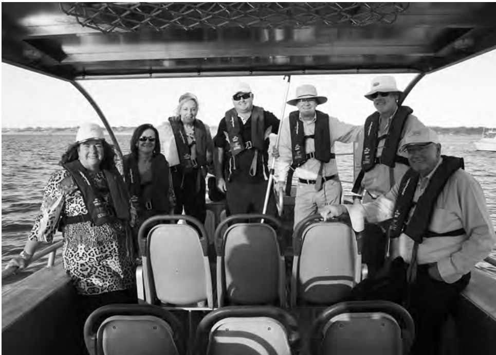
Members of the Joint Select Committee on Northern Australia during a visit to a Broome pearl farm as part of the inquiry into opportunities to expand the aquaculture industry in Northern Australia.

A key indicator for the Committee Office is the level of satisfaction with committee advice and services reported by members in the annual survey. In 2014–15, 100 per cent of members stated that they were extremely satisfied, highly satisfied or satisfied with the provision of procedural advice, research, analytical, report drafting and administrative support. The level of member satisfaction has been consistently high over the years. (See Appendix 3 for more detail on the survey results.)