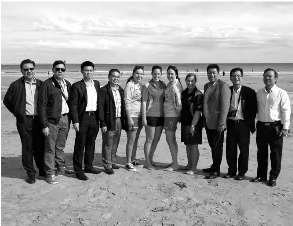
A delegation from ASEAN countries with members of the Inverloch Surf Lifesaving Club, November 2014.

In 2014-15, the budget allocation for the component was $2.493 million and expenditure was $2.233 million. Progress against the deliverable and key performance indicators for the component is summarised in Appendix 1. Staff levels, by location, are shown in Appendix 2.