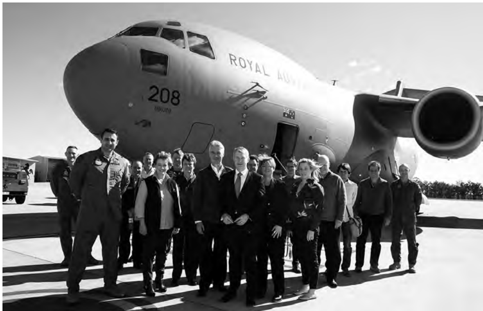
Members of the Defence Sub-Committee of the Joint Standing Committee on Foreign Affairs, Defence and Trade inspecting a C-17A Globemaster aircraft at RAAF Base Amberley.

Wherever possible, standard content drawn from SCID, such as committee contact details and membership, is automatically added to the website.