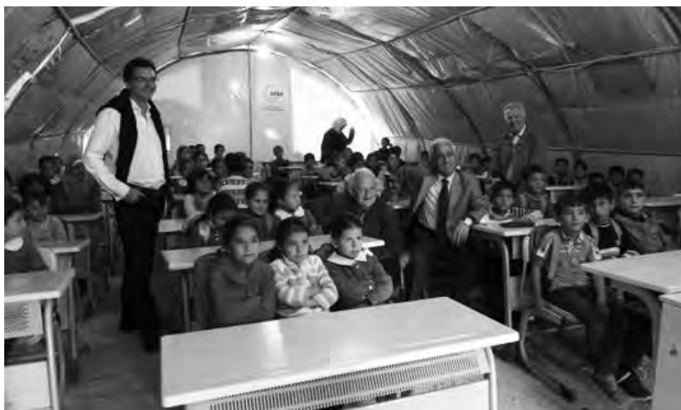
The Hon Philip Ruddock MP (centre, seated) and Mr Chris Hayes MP (standing, at right) visiting a class at Nizip refugee camp in Turkey on a parliamentary field visit, November 2014.

For the 2014 outgoing delegations program, a new initiative—the parliamentary field visit—was trialled. The destination for a field visit is chosen based on a policy issue, rather than geography, to allow a group of parliamentarians with a particular interest in an issue to broaden their knowledge and understanding and report back to the parliament.