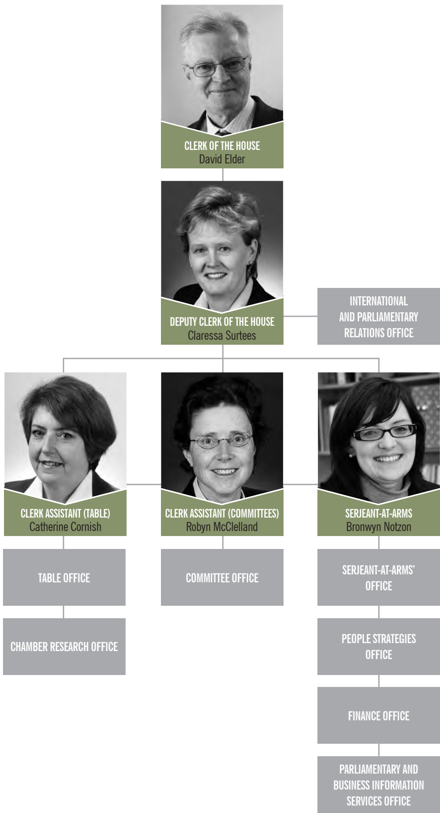
Figure 1 Organisational structure at 30 June 2015