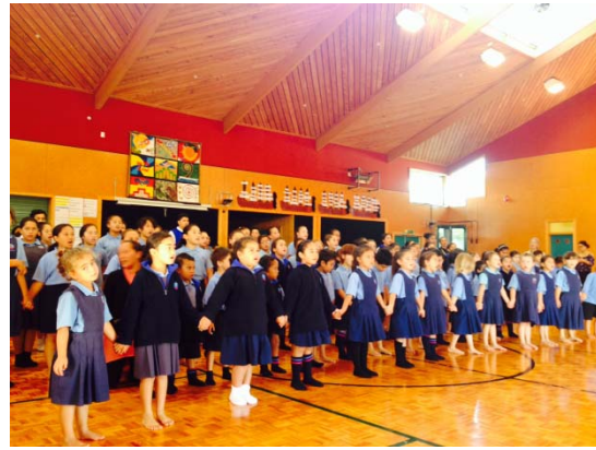
Photo: Children perform Pohiri, traditional Maori welcome ceremony

A traditional pohiri was performed by staff and students for the delegation. The pohiri is a traditional Maori welcome ceremony which usually takes place when going onto a marae (meeting place).