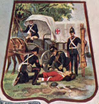
ROYAL ARMY MEDICAL CORPS