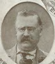
HON. SIR GEORGE TURNER, P.C., K.C.M.G. TREASURER.