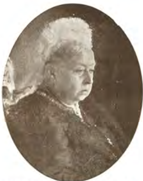
HER MAJESTY THE QUEEN.