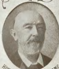
HON. SIR JAS DICKSON, K.C.M.G. MINISTER OF STATE FOR DEFENCE.