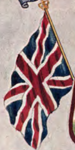
HER MAJESTY THE QUEEN