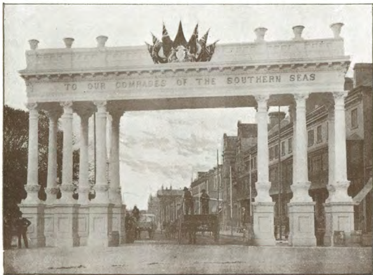
MILITARY ARCH, OXFORD STREET.