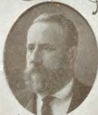
HON. C.C. KINGSTON. MINISTER OF STATE FOR TRADE & CUSTOMS.