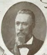
HON. SIR W m LYNE, K.C.M.G. MINISTER OF STATE FOR HOME AFFAIRS