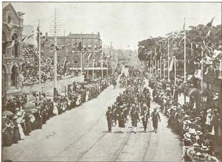
INDIAN INFANTRY PROCEEDING ALONG OXFORD ST.