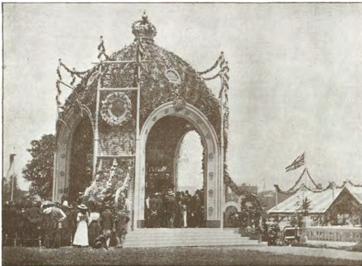
RECEPTION PAVILION, FARM COVE.