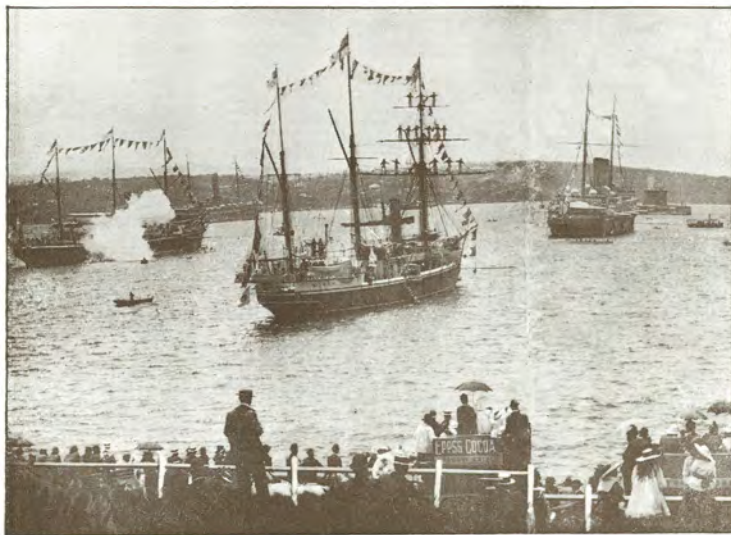
SALUTING THE "ROYAL ARTHUR."