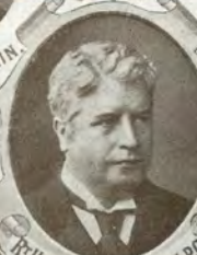
HON. EDMUND BARTON, P.C.