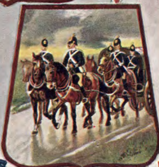
ARMY SERVICE CORPS