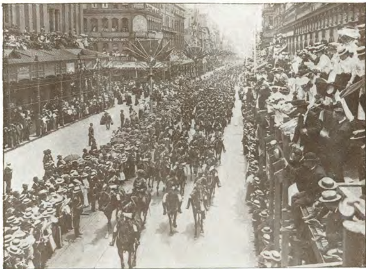
INDIAN CAVALRY PROCEEDING ALONG GEORGE ST.