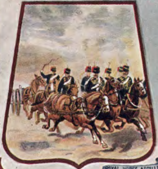
ROYAL HORSE ARTILLERY