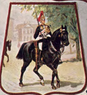
ROYAL HORSE GUARDS