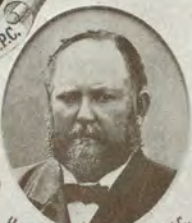
HON. SIR JOHN FORREST, C.C.M.G. POSTMASTER-GENERAL.