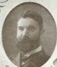
HON. ALFRED DEAKIN. ATTORNEY-GENERAL AND MINISTER FOR JUSTICE