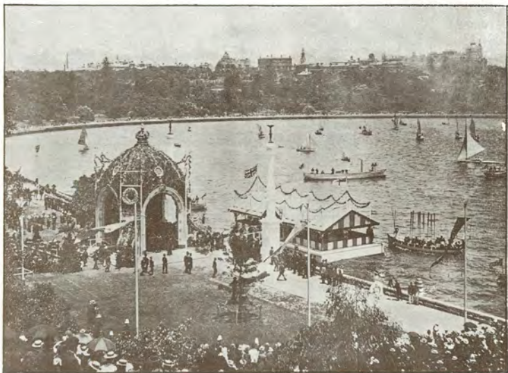
GOVERNOR-GENERAL LANDING AT FARM COVE.