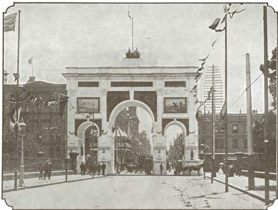
Citizen's Commonwealth Arch, Park Street.