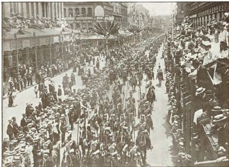
21ST LANCERS PROCEEDING ALONG GEORGE ST.