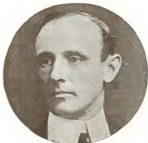
LORD HOPETOUN (Governor-General).