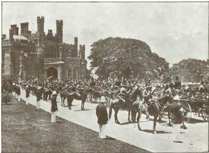
GOVERNOR-GENERAL ARRIVING GOVERNMENT HOUSE,