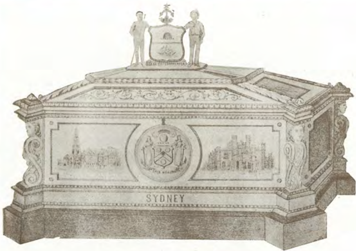
CASKET PRESENTED BY THE SYDNEY CITY COUNCIL TO THE GOVERNOR-GENERAL.

COMMONWEALTH INAUGURATION, JANUARY 1, 1901,