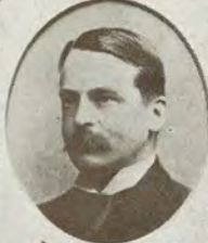
HON. N.E. LEWIS. MINISTER OF STATE. (WITHOUT PORTFOLIO.)