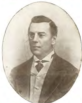
RIGHT HON. J. CHAMBERLAIN (Colonial Secretary.)

"Let the five free nations witness." But the young Queen answered swift, "It shall be crown of the crowning to hold our crown for a gift ; In the days when our folk were feeble, thy sword make sure our lands ; Wherefore we come in power to beg our crown at thy hands."