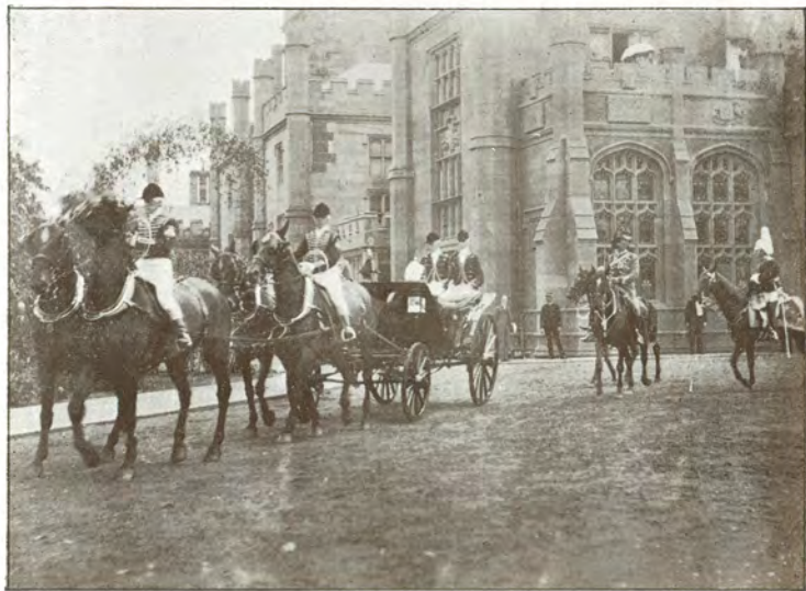
GOVERNOR-GENERAL LEAVING GOVERNMENT HOUSE.