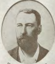
HON. R.E. O'CONNOR. MINISTER OF STATE. (WITHOUT PORTFOLIO.)