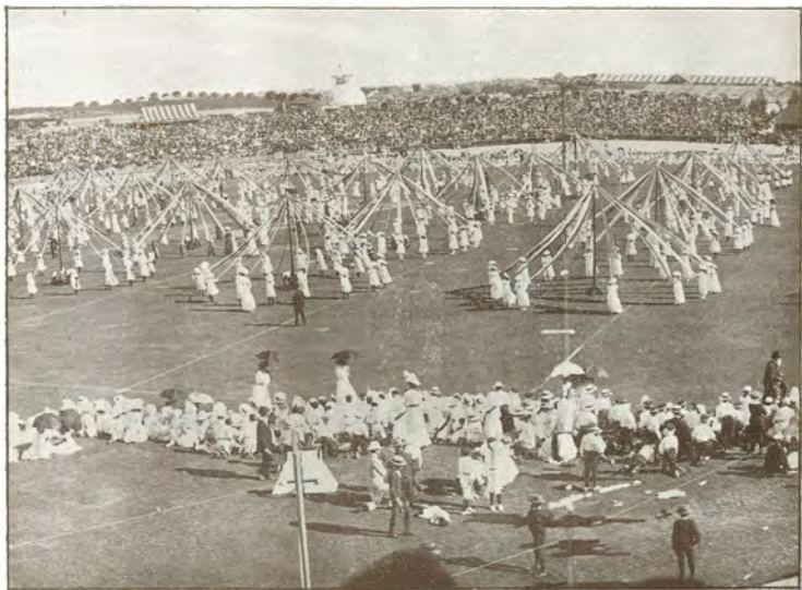
PUBLIC SCHOOLS' DEMONSTRATION—MAYPOLE DANCE.