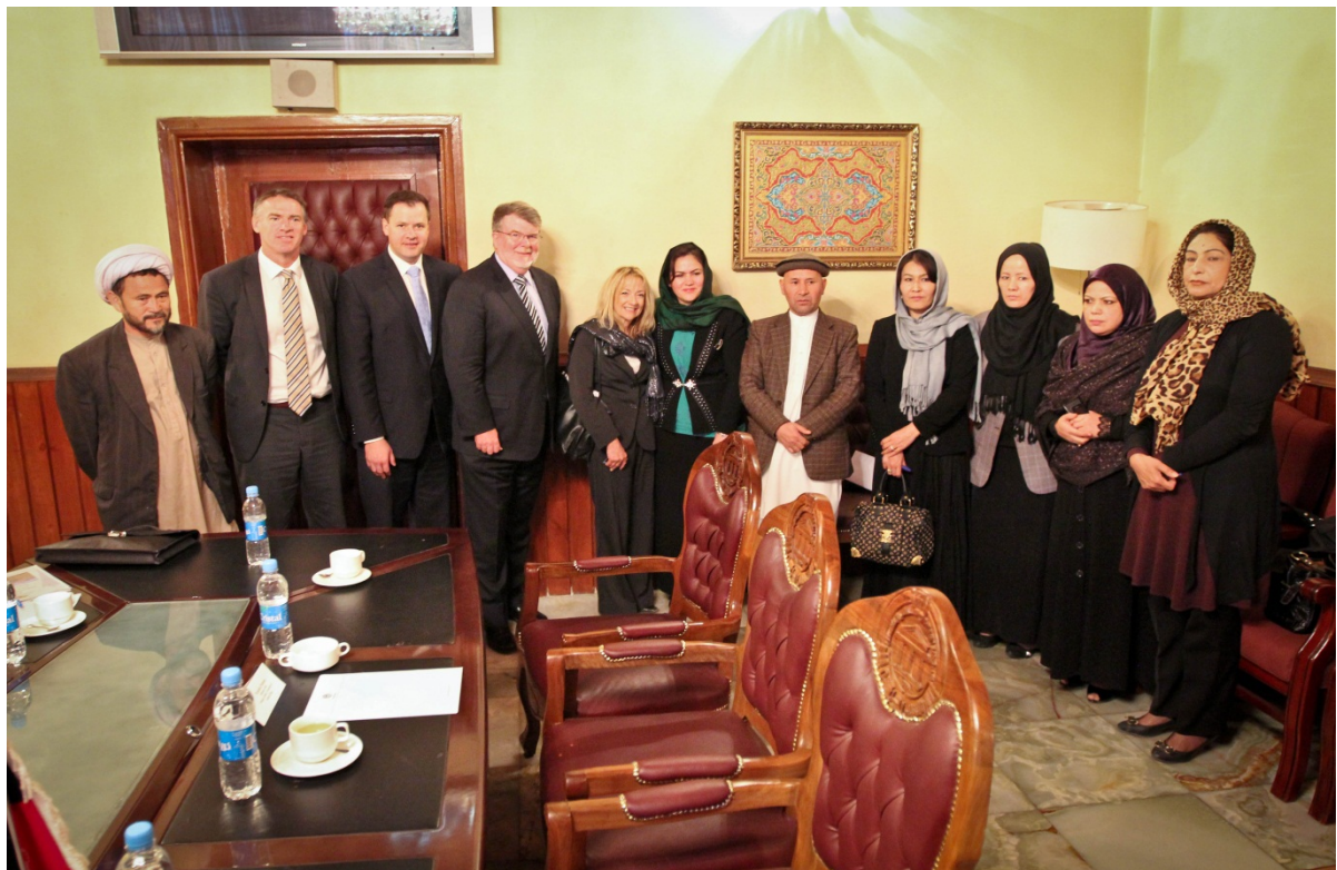
Figure 9. Meeting with Lower House Women's Committee

One of the most powerful impressions taken away by delegation members was that made by Afghanistan's women parliamentarians and by female officials and NGOs met during the course of meetings and visits.