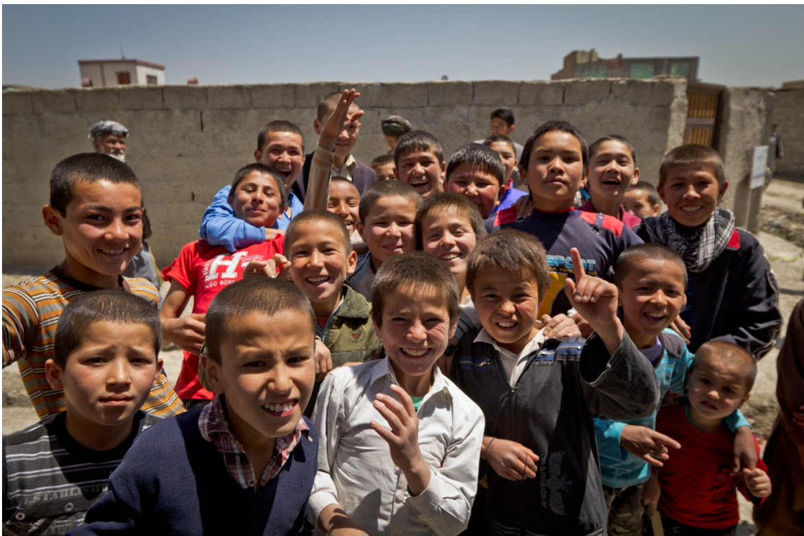
Figure 13. Children at the Kabul Informal Settlement