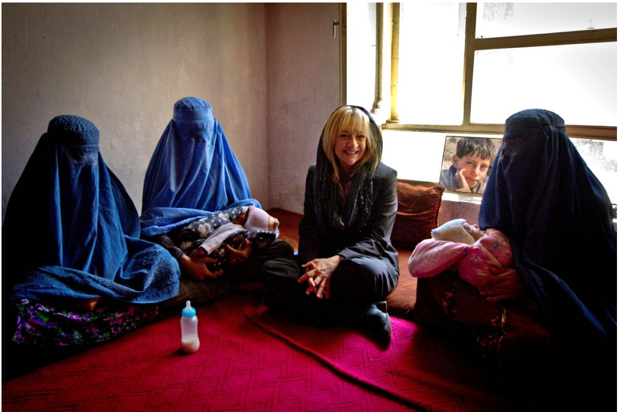
Figure 8. Ms Nola Marino MP, deputy delegation leader, with young Afghan mothers at the Kabul Informal Settlement

The delegation inspected the Sharak Aria site, where the WFP manages a program which provides for approximately 45 breast-feeding women and 25 children with moderate or acute malnutrition.