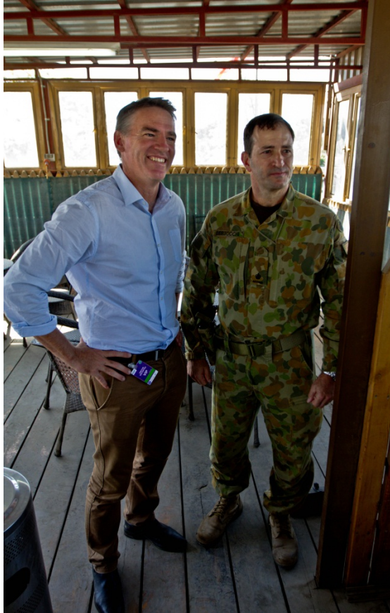
Figure 5: Mr Rob Oakeshott MP with ADF embedded staff at the International Security Force Headquarters, Kabul