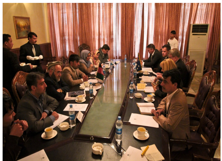
Figure 3. Information exchange with Lower House Natural Resources and Environment Committee chaired by MP Mohammad Zakria (left centre)

In the parliamentary compound, the delegation met with Lower House leaders, including Chairs of the International Affairs Commission, Budget and Finance Commission, Legislative Commission, Defence Commission, Applications and Complaints Commission, and Environment and Natural Resources Committee.