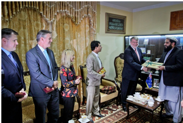
Figure 11. Exchange of goodwill gifts with Speaker of the Upper House H E Mr Fazel Hadi Muslimyar

the time is right to engage more closely and systematically with Afghan MPs, the public service and civil society members.