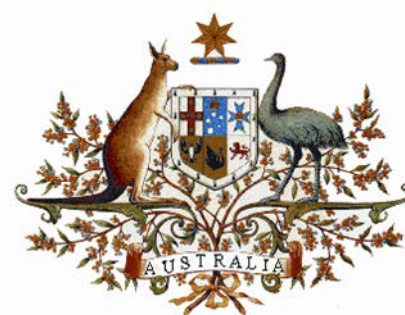
The Australian Coat of Arms

Since 1901 the Constitution has been reviewed by several official bodies, including a Royal Commission (1929); a Conference of Commonwealth and State Ministers (1934); a Convention of Members of Commonwealth and State Parliaments (1942); a Parliamentary Joint Select Committee (1956); a Constitutional Convention (1973); a Constitutional Commission (1988); and a Republic Advisory Committee (1993).