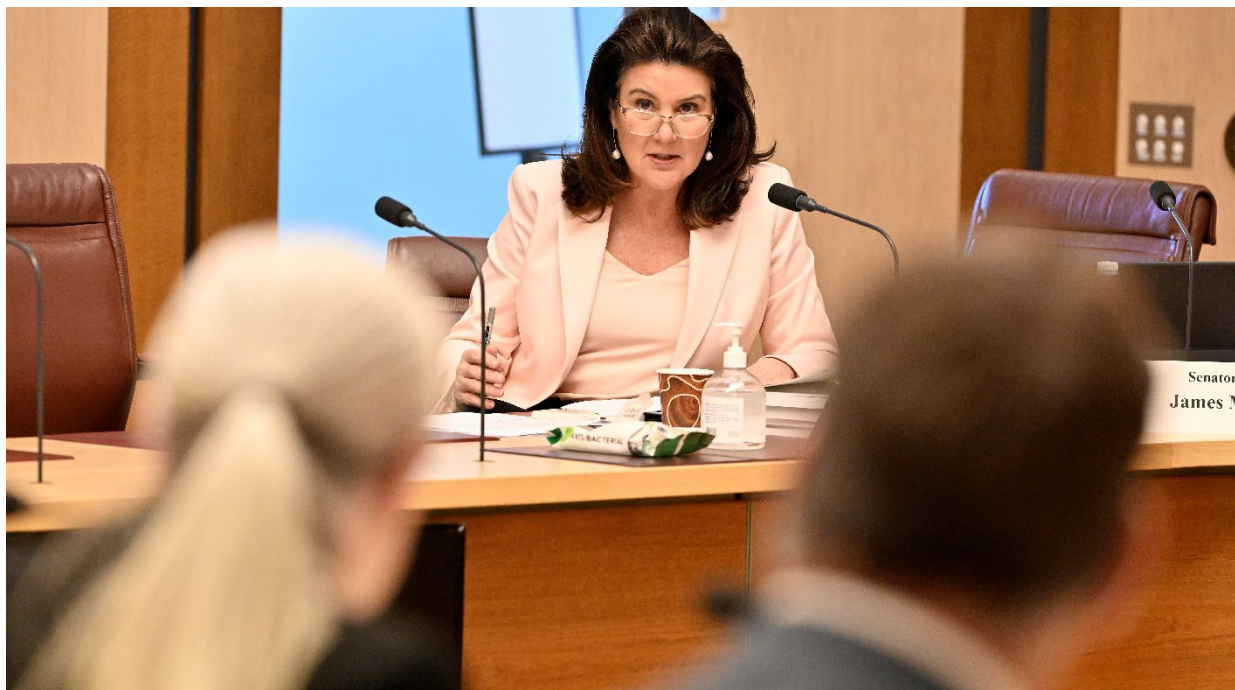
Senator the Hon Jane Hume questions witnesses during the Finance and Public Administration Legislation Committee Budget estimates 2022–23.

For more information on the consideration of estimates see Senate Brief No. 5, Consideration of Estimates by the Senate's Legislation Committees .