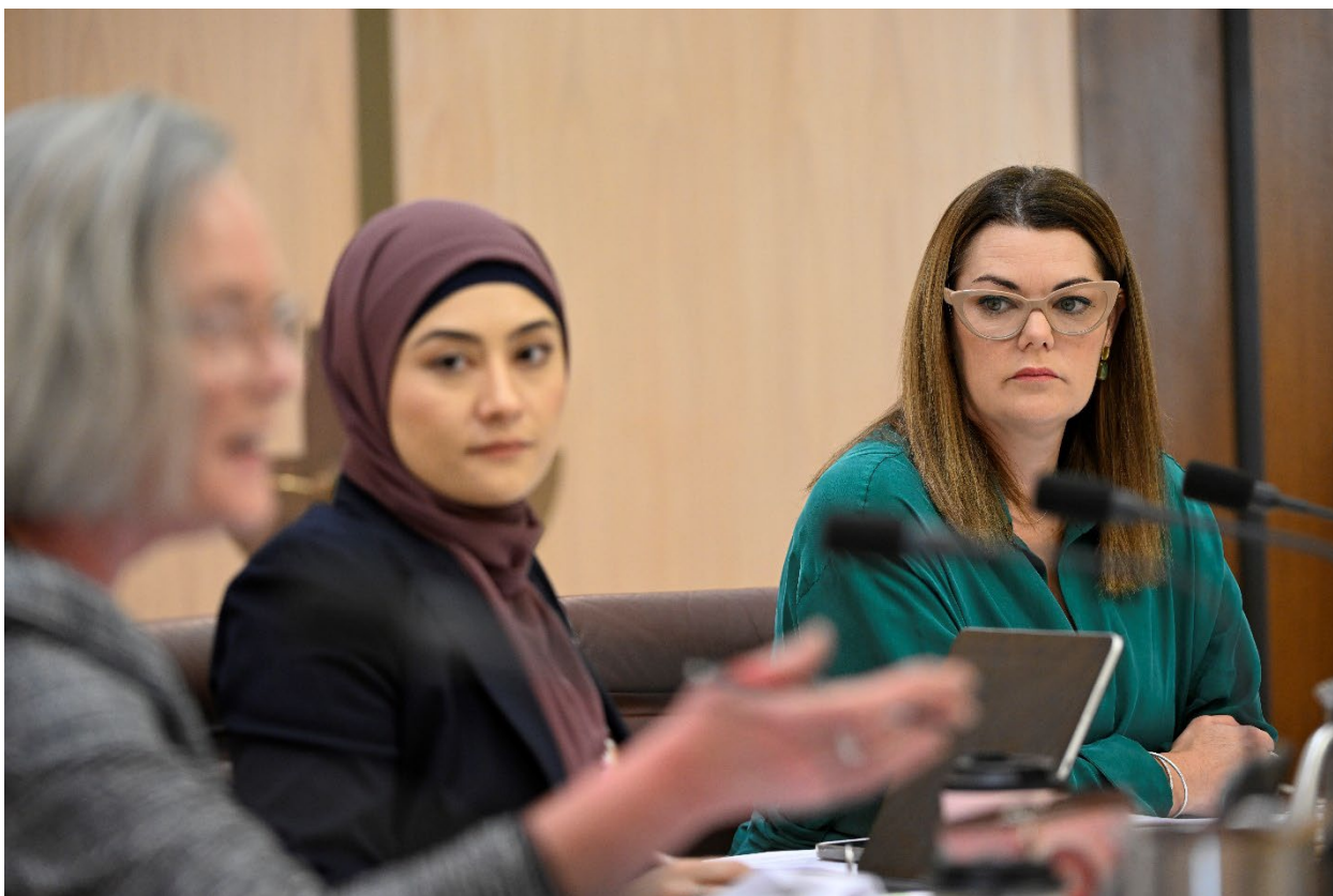
Senators Hanson-Young, Payman and Grogan during the Environment and Communications Legislation Committee public hearing into the provisions of the Water Amendment (Restoring Our Rivers) Bill 2023.

The practice of routinely referring bills to committees has given Senate committees a greater role in the consideration of legislation. A committee has no power to amend a bill referred to it, but it may recommend amendments or it may advise the Senate to agree to the bill without changes.